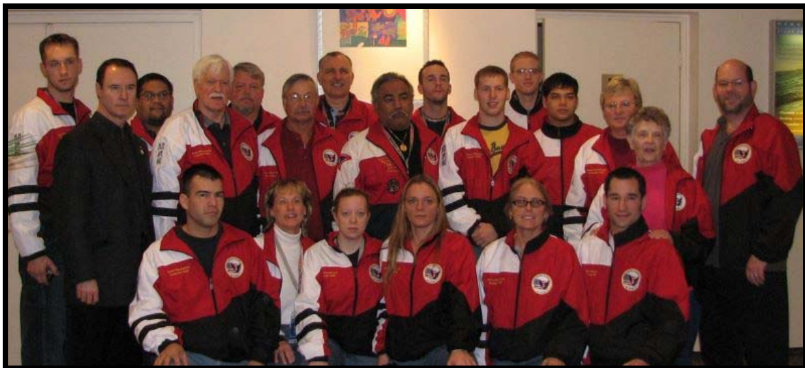
JU-JITSU TEAM USA: Athletes, Coaches, Referees and Officials at the 2006 WORLD JU-JITSU CHAMPIONSHIPS in Rotterdam, Holland.