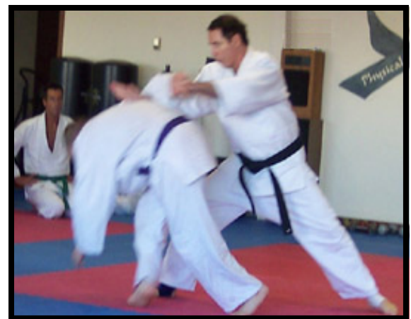
National Certification Training Events!

Now, is your opportunity to attend or schedule a National Certification Training Seminar conducted by the USJJF. Both Ju-jitsu and Traditional Judo are being conducted across the USA!! "One Day" to "Four Day" Events are now available and being conducted by Senior USJJF Yudansha. Training Subjects include; Intensive Curriculum Courses, Kata Certification Training, Referee Training, and Competitor Orientation are available and being scheduled by contacting the USJJF National Office at 1-703-920-1590 or 1-800-676-8087 .