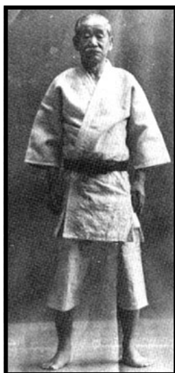
Prof. Jigoro Kano

Welcome to the USJJF National Program - United States of America - Traditional Kodokan Judo (USA-TKJ). For More Details, visit: